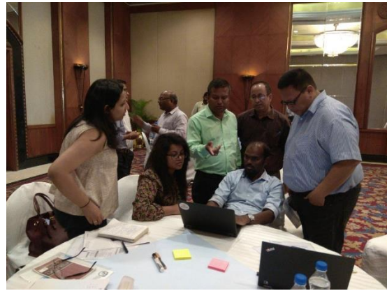
State implementation plan being discussed