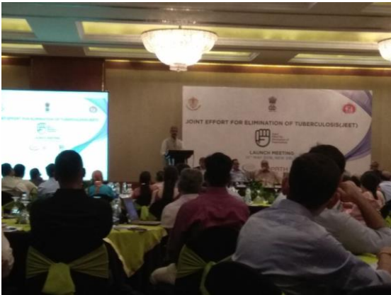
Launching of the JEET project

State TB Officers and WHO Headquarter Consultants were requested to participate in the “JEET Project Launch Meeting” in New Delhi, Tuesday, 15 th May 2018.