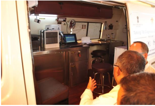
Expaining the utilities of CBNAAT!