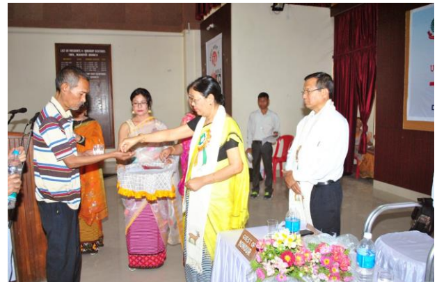
DOT demonstration by IMA Past President!