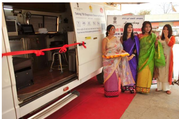
CBNAAT van ready for inauguration!

Shri L. Jayantakumar Singh, Hon'ble Minister of Health & Family Welfare inaugurated the CBNAAT Mobile Van and declared 5 different benefit of the TB Patients to end TB 2025.