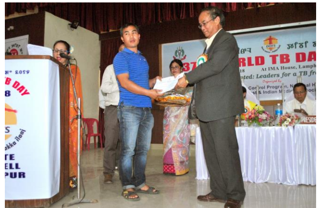
Best DOT providers