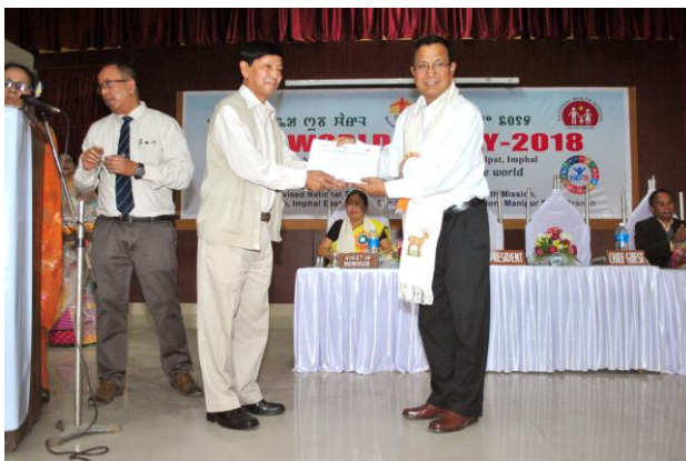
Certificate awards to the Private sectors for contribution in private TB notification!