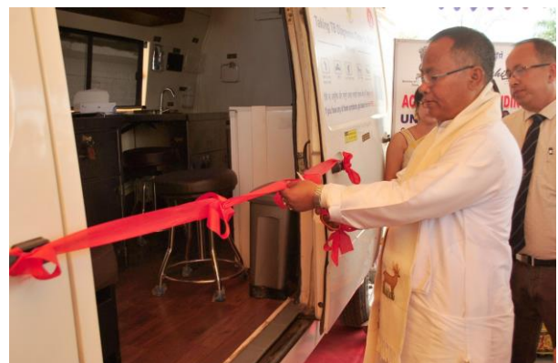
The Inauguration by the Hon'ble Health Minister