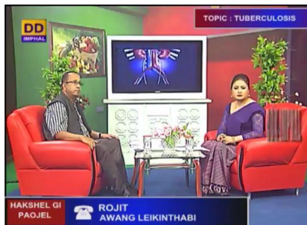
State Tb Officer A live phone-in Programme on RNTCP at DDK, Imphal on 27 th March 2018 at 5.30 PM.