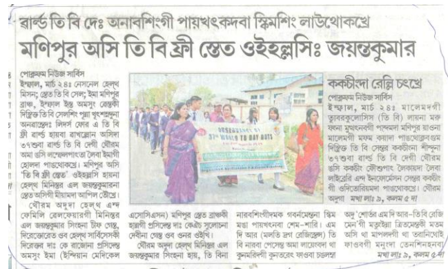
Observance of World TB Day 2018, in the Newspapers