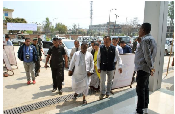
Arrival of the Chief Guest!