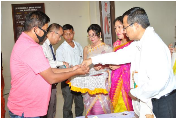
DOT demonstration by the Mission Director!