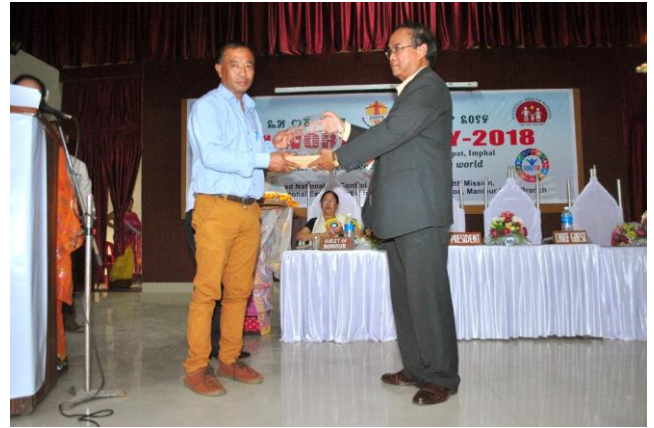
Encouraging RNTCP staff for sincerity!