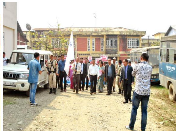
State Mission Director leading the rally!

The observance started with a rally from R& D wing Medical Directorate complex to IMA house Lamphelpat. The rally was flag off by the Director of Health Services/ SMD Manipur. All the Health workers, staffs, School students, Nursing students , Departmental officers, NGOs members, invitees was took part in the rally.