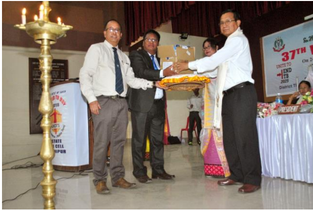
Distribution of tablets to the districts!