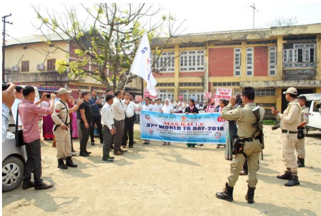
State Mission Director flagging off the rally!