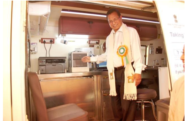
State Mission Director in the CBNAAT van!

The observance continued with the demonstration of DOT by the dignitaries.