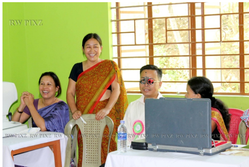
FREE SCHOOL EYE SCREENING PROGRAMME in OBSERVANCE OF WORLD SIGHT DAY 2018 at MEGA MANIPUR, YARALPAT on 13 th March 2017 by NPCB MANIPUR.