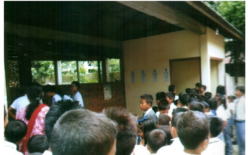
FREE SCHOOL EYE SCREENING PROGRAMME at Maklang High School on 22 nd August 2017, Organized by NPCB MANIPUR.