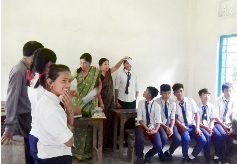
FREE SCHOOL EYE SCREENING PROGRAMME at Yumnam Huidrom High School on 21 st August 2017, Organized by NPCB MANIPUR.