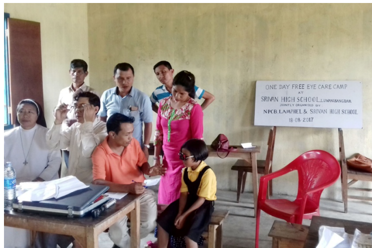
FREE SCHOOL EYE SCREENING PROGRAMME at Srivan High School, Luwangsangbam on 18 th August 2017, Organized by NPCB MANIPUR.