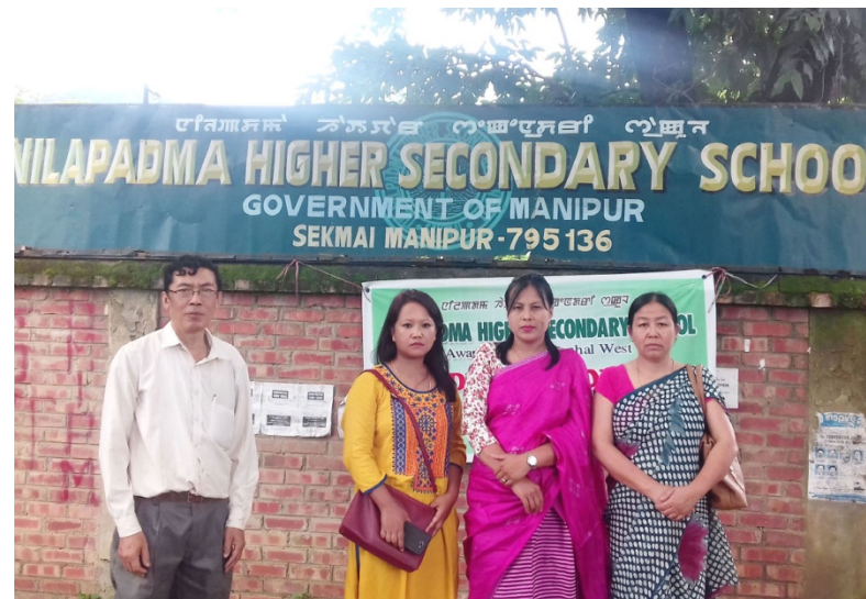
FREE SCHOOL EYE SCREENING PROGRAMME at Ch. Tula Singh Junior High School & Nilapadma High School, Sekmai on 14 th August 2017, Organized by NPCB MANIPUR.