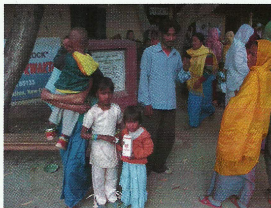
A family holding free medicines