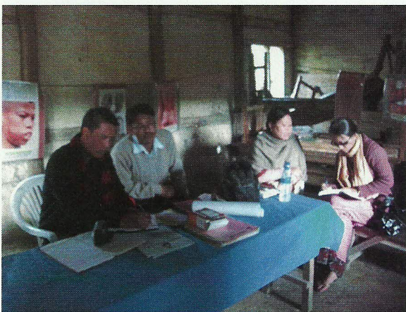
Interaction with the organiser