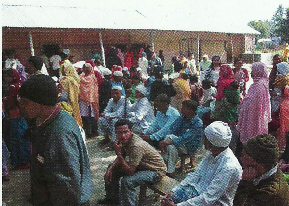
Waiting in queue