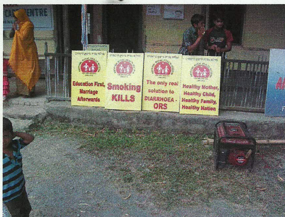
Use Of IEC