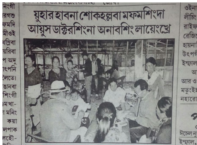
Free AYUSH health and relief camp at Earthquake affected areas in Kangpokpi and Tamenglong District.