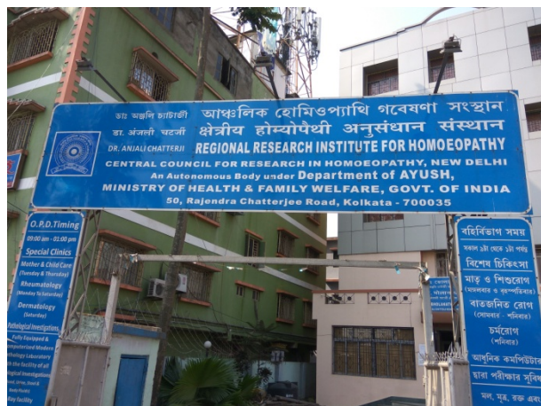
Two days capacity building on AYUSH Health belt to the tribal inhabited areas at Regional Research Institute for Homeopathy, Kolkata on 13 th May 2017.