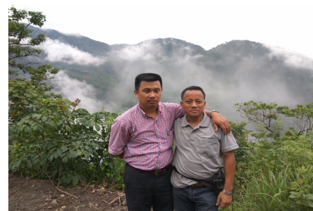
Visiting Sandang Senba Village of Kpi Dist on 5 th June 2017