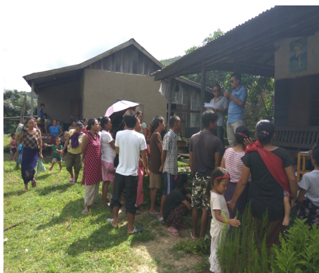
Distribution of AYUSH (HOM) Medicines for JE, Dengue & Swine Flue at Beiham in Churachandpur on 31 st June 2017.