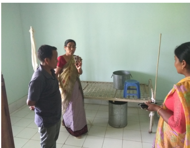
Visit to Kakching Khunou PHC and discussing with Local Clubs about exclusive Yoga & NC treatment on 8 th May 2017