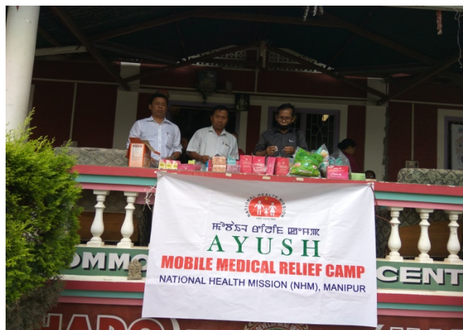
AYUSH mobile medical camp conducted in different places during the flood July 2017.