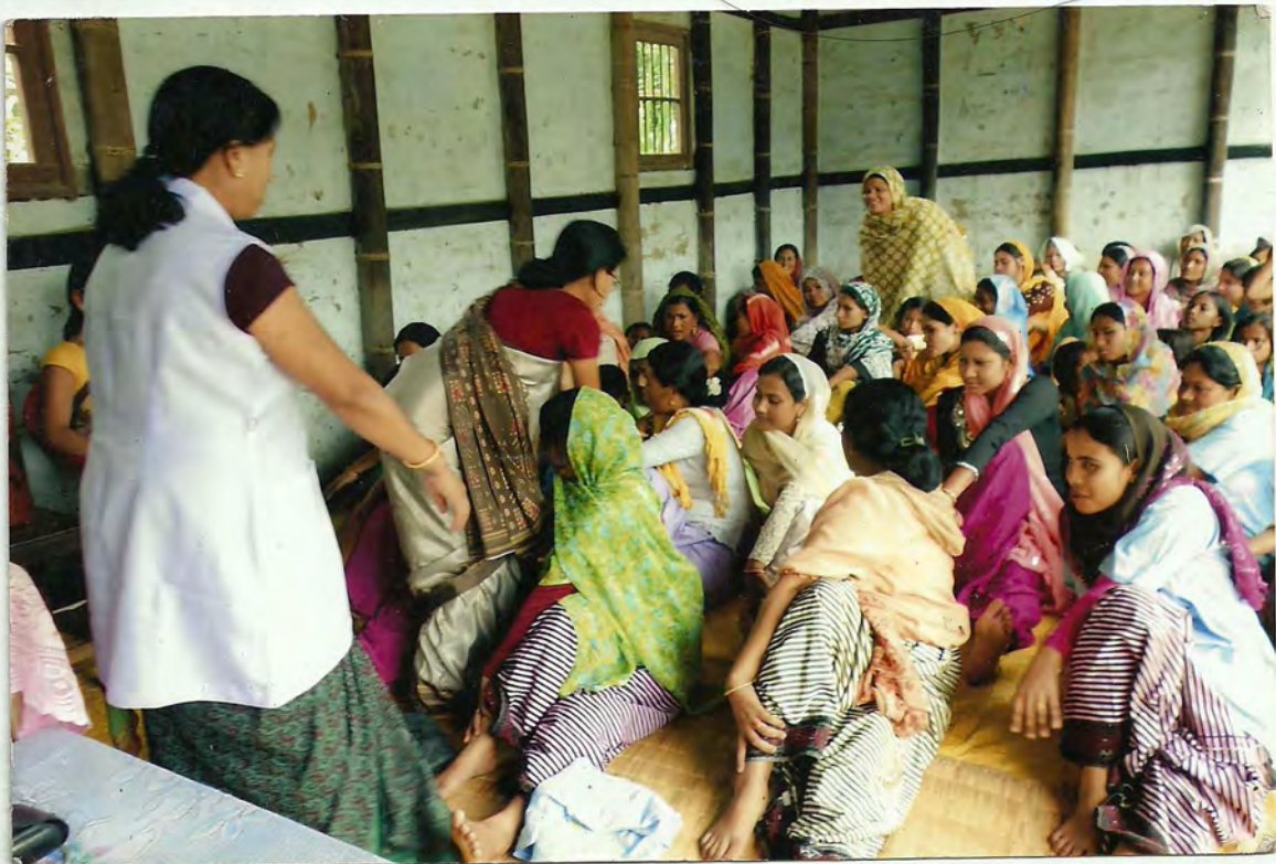
YOGA CLASS CONDUCTED BY AYURVA DOCTOR IN IMPHAL EAST DISTRICT.