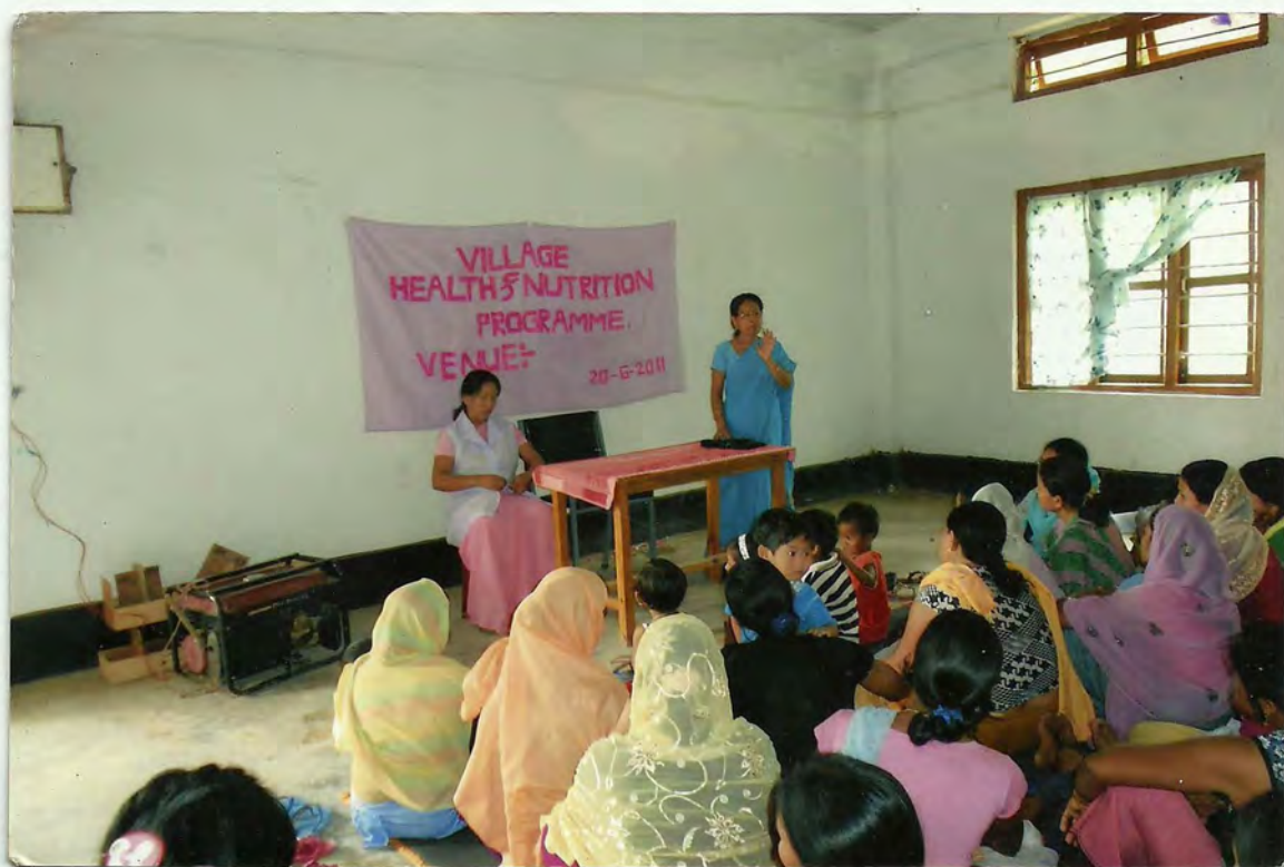
VILLAGE HEALTH & NUTRITION DAY CONDUCTED IN THE PRESENCE OF AYURVA DOCTOR IN IMPHAL EAST.